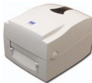
LT8 Thermal Printer

Other powerful features include: 512KB Flash memory (standard) for forms, graphics, and external font storage; 256KB SRAM for longer label lengths; standard parallel, serial, and USB interfaces; fonts and character sets; and Zebra Programming Language.