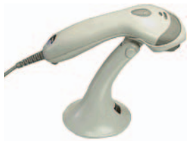
MS9540 Trigger Reader

The feature-packed MS9520 Voyager comes equipped with PowerLink user-replaceable cables and power supply, MetroSelect one-code programming, MetroSet Windows-based software configuration utility, Bits n' Pieces data editing utility, and an Electronic Article Surveillance (EAS) option.