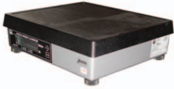
Avery Weigh-Tronix 7620

Weigh letters and parcels, all on one scale! Ideal for both large and small businesses.