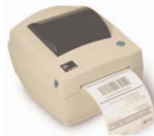
Zebra LP 2844

The industry's best, low-cost direct thermal label printers