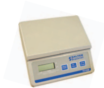
7010SB Shipping Scale

The 10-lb capacity Small Business Postal Scale is ideal for smaller offices.