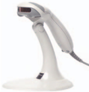
MS9520 Triggerless Scanner

Equipped for both In-Stand & Out-of-Stand operation